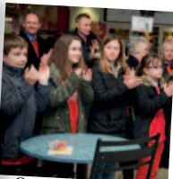
Cystadleuaeth Ysgolion School Competition

Famed for its inviting and friendly customer service and with so much to choose from, Llanelli market offers a fascinating place with a mix of the traditional and new. Overflowing with local culture, reasonably priced, interesting and useful stalls, you can take advantage of the enormous variety and choice on offer.