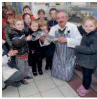
Ymweliadau Ysgolion School Visits