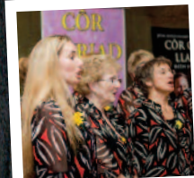
Dydd Gwyl Dewi St David's Day